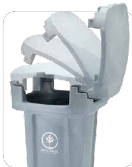
Wide opening lid speeds collection