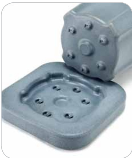
Base and body assemble quickly and securely

Made with durable, impact and graffiti resistant resins, these litter containers clean easily and have large areas for logos and slogans on all four sides. Optional granite colors and colorful in-mold labels add a welcoming, sophisticated image to any community or public space.