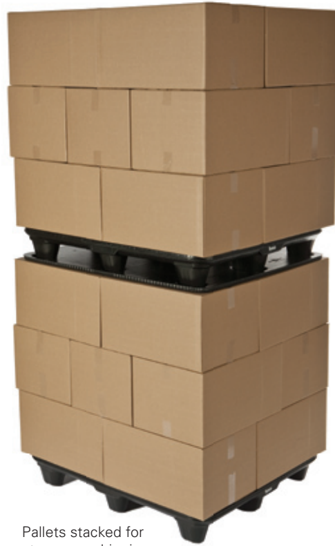
Pallets stacked for storage or shipping