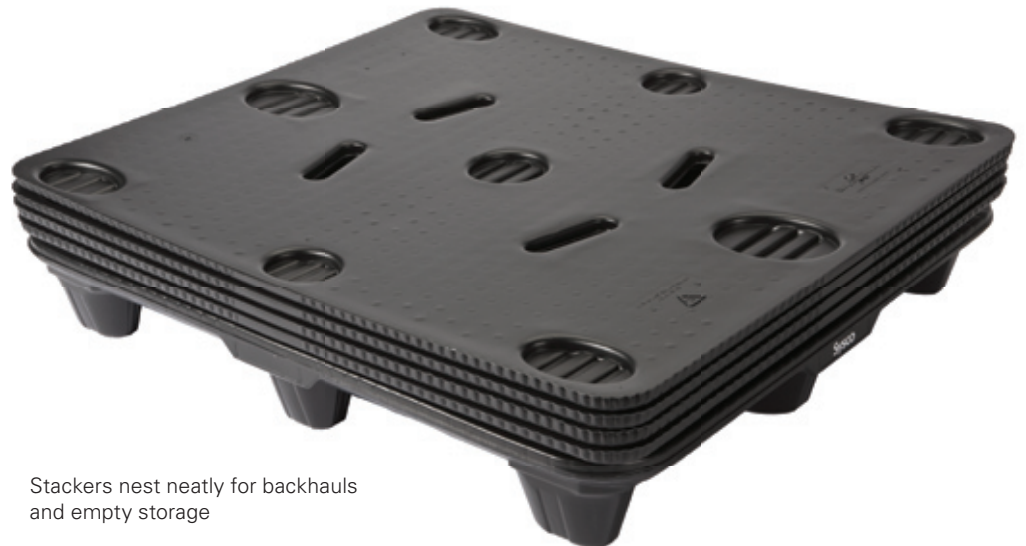
Stackers nest neatly for backhauls and empty storage