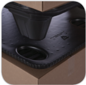
Stacking indents capture a variety of leg configurations

The Nestable Stacker provides a uniform platform for securely stacking nestable pallets with level loads in the warehouse and in trailers effectively increasing warehouse space and maximizing trailer utilization. This is especially true for product loads that cube out before weighing out trailers. Nestable Stackers are designed to accommodate a variety of nestable pallet leg configurations so they can be introduced without changing your operation or equipment.