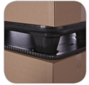
Uniformly stacks top load on bottom pallet