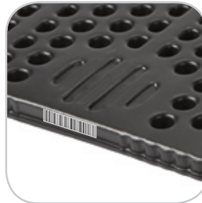
Recessed areas for barcode labels and RFID tags