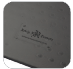
Inserts for molded-in logos