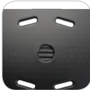
Ergonomic handles make handling easier and safer