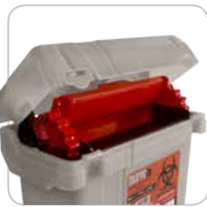
Horizontal drop with flusher