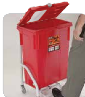
Foot pedal dolly allows hands-free operation