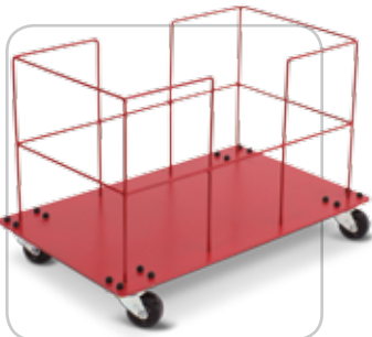
Wire dolly fits both 10 & 17 gallon containers

* Compatible with all Rehrig Sharps Containers