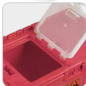
Transparent sub-lid restricts access & allows view of fill capacity