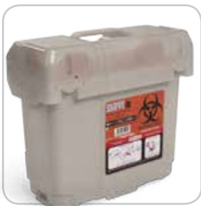
Locking lid with handle

* Compatible with all Rehrig Sharps Containers