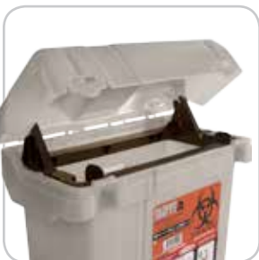
Wide mouth drop