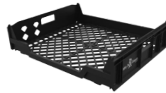
Artisan Roll Tray