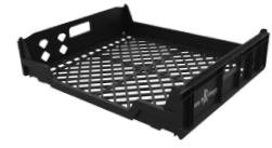
Artisan Bread/Roll Merch Tray